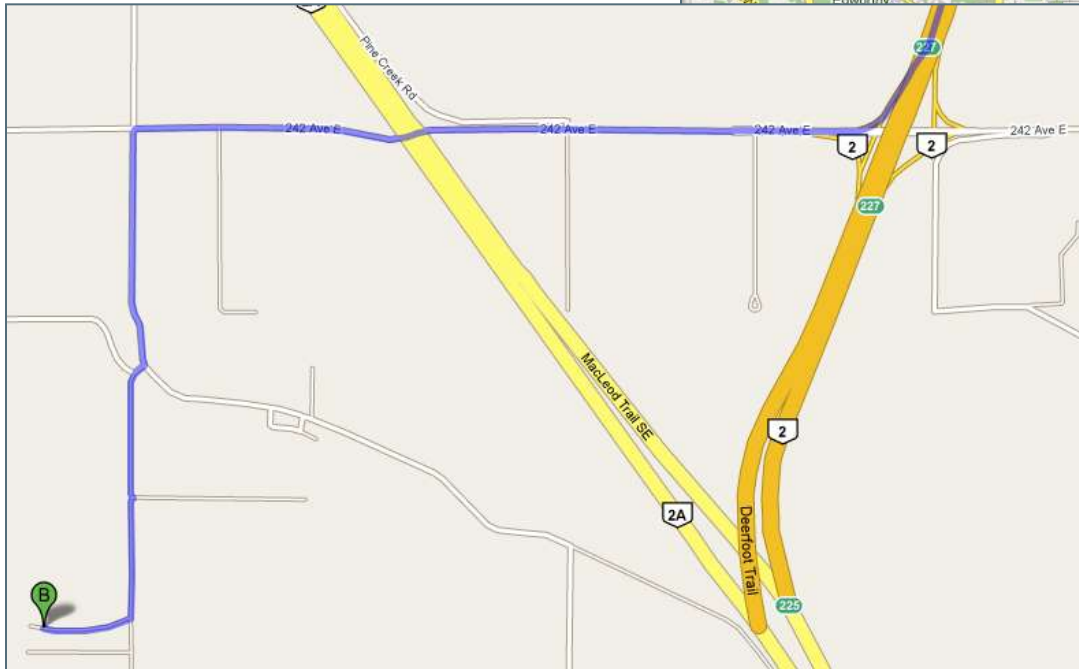
Map of DeWinton end